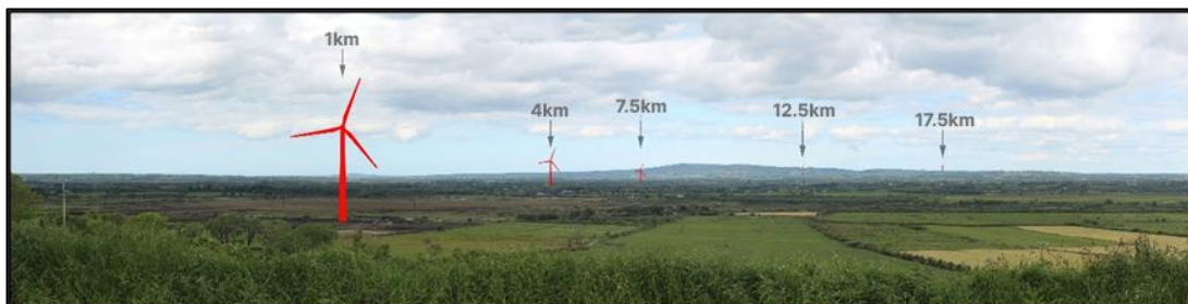
Figure 1-1: Effect of Distance on the Visibility of Wind Turbines (illustrative purposes only).